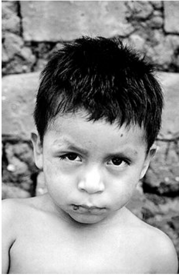
An acute Chagas disease infection with swelling of the right eye.

Chagas disease (also called American trypanosomiasis) is a tropical parasitic disease caused by the Trypanosoma cruzi . It is commonly transmitted to humans and other mammals by an insect vector, the blood-sucking bugs of the subfamily Triatominae. The disease may also be spread through blood transfusion and organ transplantation, ingestion of food contaminated with parasites, and from a mother to her fetus .