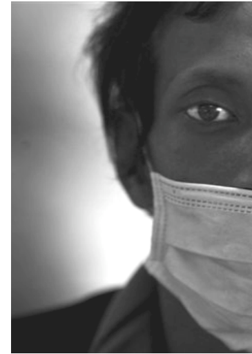
Patient with drug-resistant Tuberculosis gets treatment in Thailand.

Tuberculosis is a common and often deadly infectious disease caused by various strains of mycobacteria . It usually attacks the lungs but can also affect other parts of the body. It is spread through the air when people who have the disease cough, sneeze, or spit. Most infections in humans result in an asymptomatic, latent infection, and about one in ten latent infections eventually progresses to active disease, which, if left untreated, kills more than 50% of its victims .