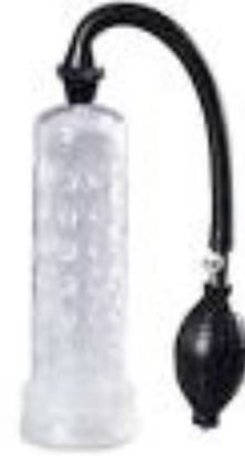
Vacuum Therapy (Penis pump).

Erectile dysfunction (ED, "male impotence") is sexual dysfunction characterized by the inability to develop or maintain an erection of the penis sufficient for satisfactory sexual performance.